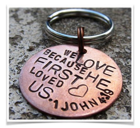
Desert Hope Lutheran Church

Meeting current needs of families so that they experience God's love in their lives; learning that they matter to God.